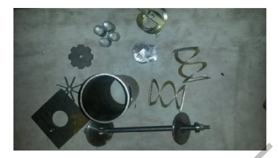
Figure 2 – Fertilizer distributor in unassembled form