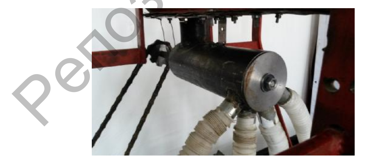
Figure 4 - The seed distributor fixed under the bunker