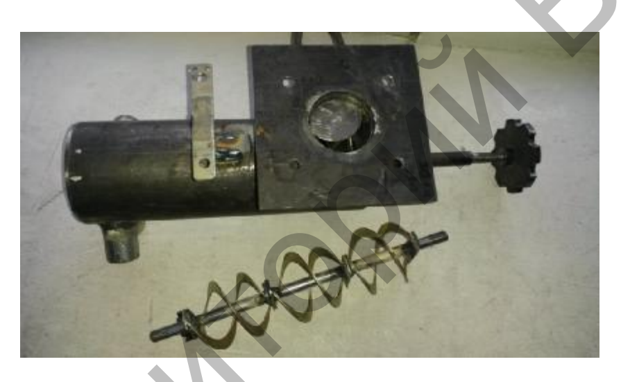
Figure 3 – Fertilizer distributor in assembled form